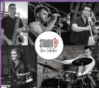
Straight Up Jazz Collective