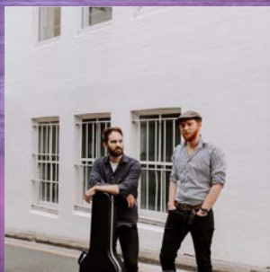
Freight Train Foxes