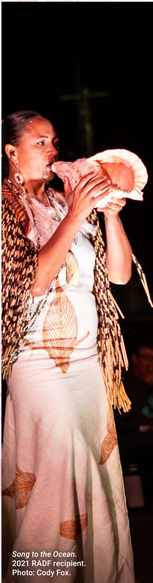
Song to the Ocean. 2021 RADF recipient.