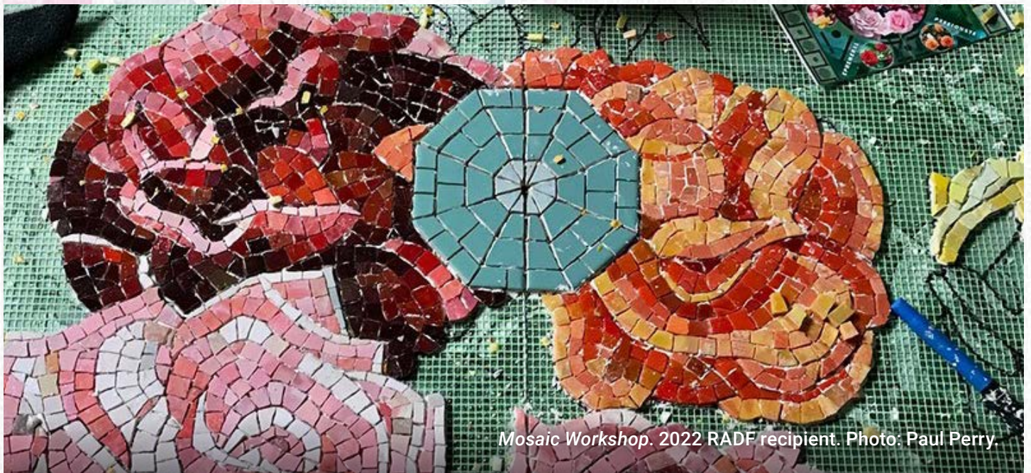
Mosaic Workshop. 2022 RADF recipient.